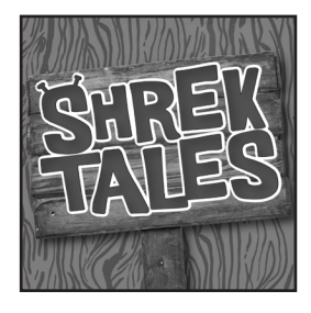
SHREK TALES WEDNESDAY NIGHT PRODUCTION CLASS:

Saturday class for ages 4-6, 6-9, and 8-13.