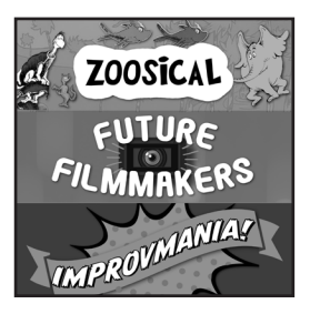
ZOOSICAL, FUTURE FILMMAKERS, IMPROVMANIA:

You've seen the show, now come learn from the pros! Check out just a few of our youth programs this spring: