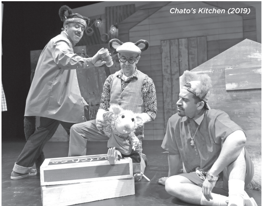
Chato's Kitchen (2019)